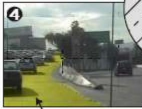
Use this lane.